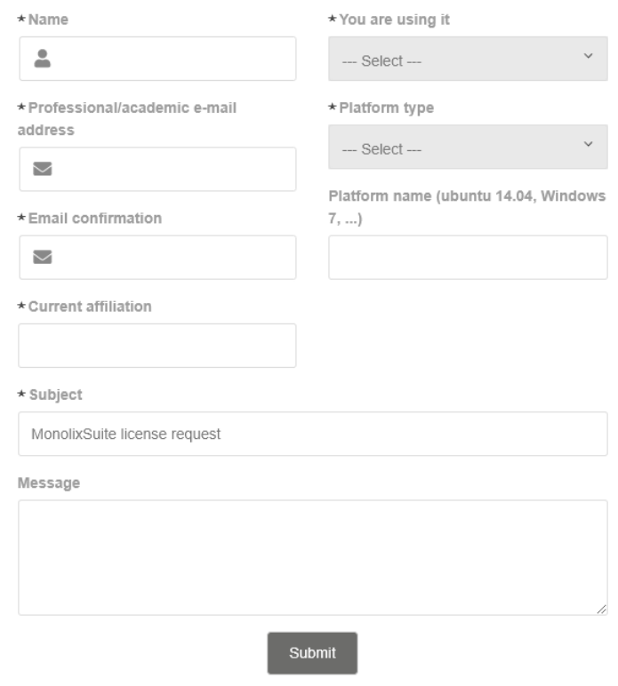
Figure 1: Request MONOLIX Licence